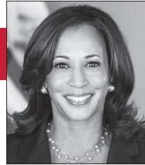
Kamala Harris (D) kamalaharris.com