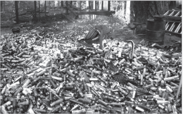
Explosion sight with butane canisters visible

Our desire is to advance the IFI mission: To boldly bring a biblical perspective to public policy. This mission is centrally motivated by two commandments: 1) To love our neighbors as ourselves, and; 2) to teach all nations to observe all that God has commanded us.