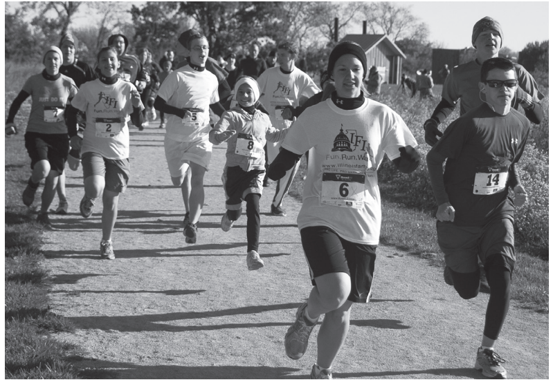
Runners brave the cold morning temperatures to participate in the Fun. Run. Walk.

When all the contestants were finished, they were rewarded with fresh chicken sandwiches provided by a local Chick-fil-a. It was a wonderful time of fellowship. Chick-fil-a's lovable mascot, "the cow," was present, contributing "udder" joy to the crowd. Thanks to Chick-